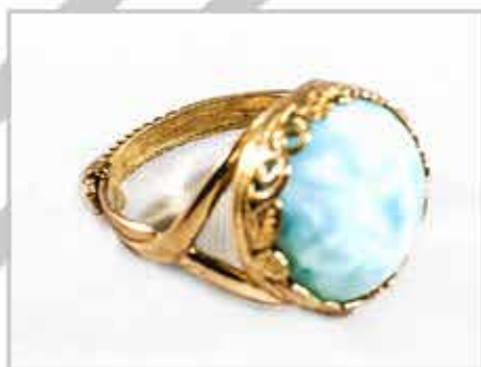
L to R ) Mer-Mazing Larimar Necklace, Girls Just Wanna Have Sun Choker, Girls Just Wanna Have Sun Necklace, Larimar Leather Cuff, Larimar Ring