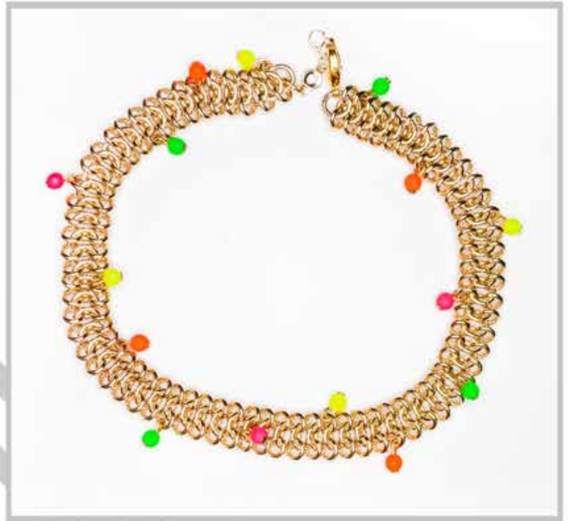
L to R) Sippin' Coconuts Wrap Necklace, Resort Fully Yours Choker, Lets Get Coco- Nutty Wrap Necklace