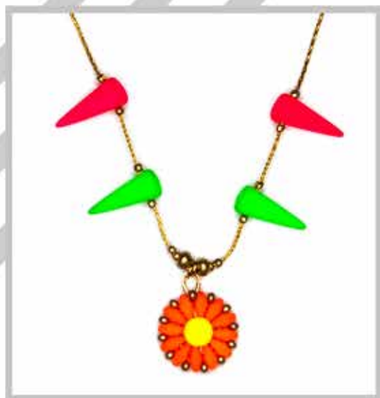
L to R) Hello Sunshine Anklet, Forever Fiesta Earrings in Multi, Brighter the Hoop Bigger the Party Earrings, Bloom Baby Bloom Choker, String Him Along Fiesta Earrings