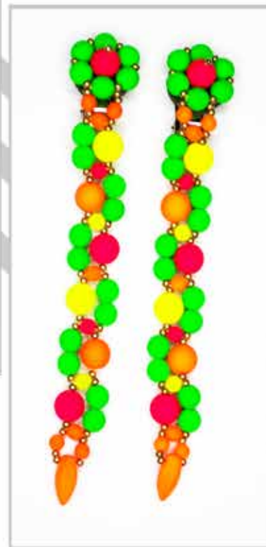
L to R) Forever Fiesta Earrings in: Yellow, Pink, Orange